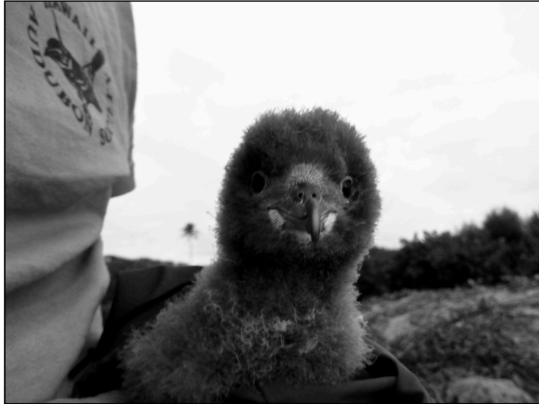
A downy 2.5 month-old Wedge-tailed Shearwater chick being weighed as part of the weekly colony monitoring.

Habitat Restoration: From January through March 2013, while the birds were at sea, Hawai'i Audubon Society members and other volunteers worked to remove alien plant species from the preserve and to maintain wedge-tailed shearwater burrows and nesting sites. Weekly fieldwork opportunities attracted a wide variety of participants, ranging from wildlife conservationists and scientists, to gardening enthusiasts, neighbors and young student groups. These efforts support the work done in 2011 and 2012 by professional native plant landscapers from Hui Ku Maoli Ola, who transformed a vacant house-lot into a unique example of pre-contact Hawaiian dryland coastal habitat with multiple shearwater nesting sites. Repeat volunteers have found it extremely satisfying to